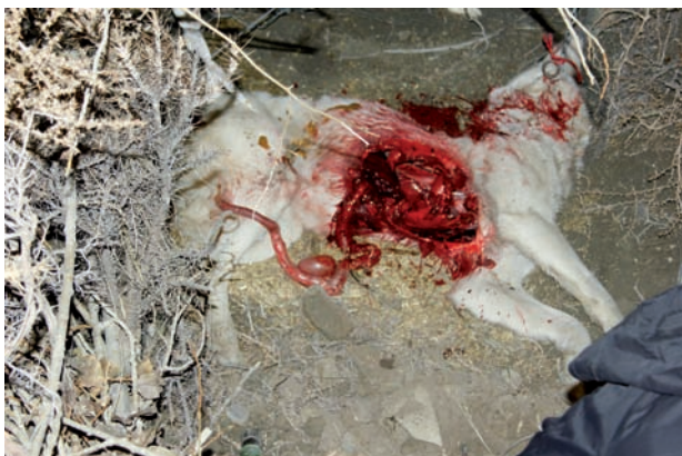
Fig. 3. The herd dog killed by the leopard and used as bait for the trap.

Between mid-August and mid-December 2014, the leopard killed 15 herd dogs (Fig.3),