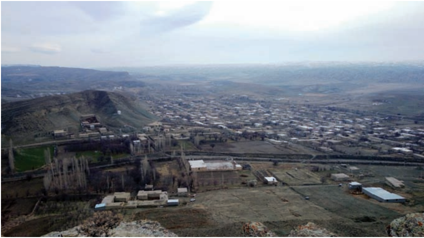
Fig. 2. View of Tazeh Ghaleh village, photographed from a ridge where the leopard was frequently seen.

pastures. After October, most herds concentrated their daily grazing around the village and livestock were contained in corrals, within the village, overnight. During an attack on one herd, dogs chased the leopard, which killed one of them. The leopard then attacked three people who tried to approach it on the dead dog. As a result, the villagers were fearful and stayed within their homes overnight. Following snowfall in November 2014, the leopard's tracks were seen along the main routes through the village and its scrapes were found on the roof of a house.