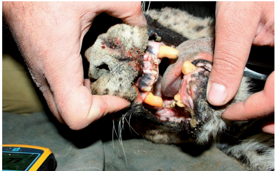
Fig. 4. The leopard's teeth were yellow with well-worn and broken canines and incisors which revealed that it is an old adult male leopard, estimated more than 10 years-old.

We are indebted to the Conservation of Asiatic Cheetah Project and Panthera for sharing trapping