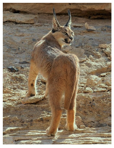
Fig. 1. A caracal in the vicinity of Nadushan, Yazd Province, in May 2009. Accused of killing domestic fowl, this caracal was chased by local villagers into a water canal to get drowned, but was eventually rescued by the local wildlife authority.

The caracal was first classified by Schreber (1776) as a species of the genus Lynx , however, later assigned to the Felis group. More recent incorporation of morphological and molecular studies has proposed a new lineage, Caracal , with two genera, Caracal and Leptailurus . Hence, three species of Caracal , caracal C. caracal , African golden cat