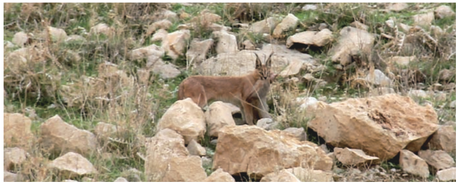
Fig. 5. A caracal photographed in Khaeez Protected Area, Kohgiluyeh-va-Buyer Ahmad Province, in February 2013, preying on a mongoose.