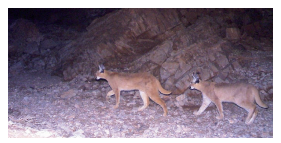
Fig. 4. A pair of caracals photographed in Darband-e Ravar Wildlife Refuge, Kerman Province, in February 2014.