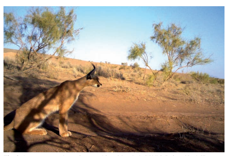
Fig. 3. A camera-trap photo of a caracal from Miandasht Wildlife Refuge, North Khorasan Province, in October 2014.

Akbari H., Azizi M., Poor Chitsaz A. & Nooranian S. R. 2016. Distribution, abundance and activity pattern of caracal ( Caracal caracal ) in Yazd, Iran. Experimental Animal Biology 15, 71-78. (In Persian)