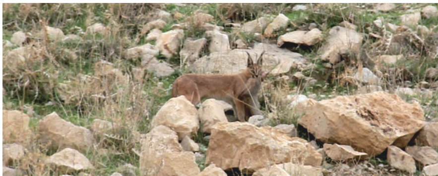
Fig. 5. A caracal photographed in Khaeez Protected Area, Kohgiluyeh-va-Buyer Ahmad Province, in February 2013, preying on a mongoose.