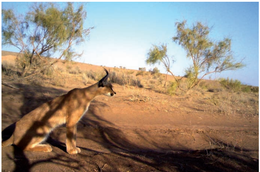
Fig. 3. A camera-trap photo of a caracal from Miandasht Wildlife Refuge, North Khorasan Province, in October 2014 (Photo ICS/DoE/CACP).