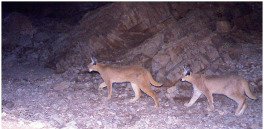
Fig. 4. A pair of caracals photographed in Darband-e Ravar Wildlife Refuge, Kerman Province, in February 2014 (Photo ICS/DoE/CACP/Panthera).