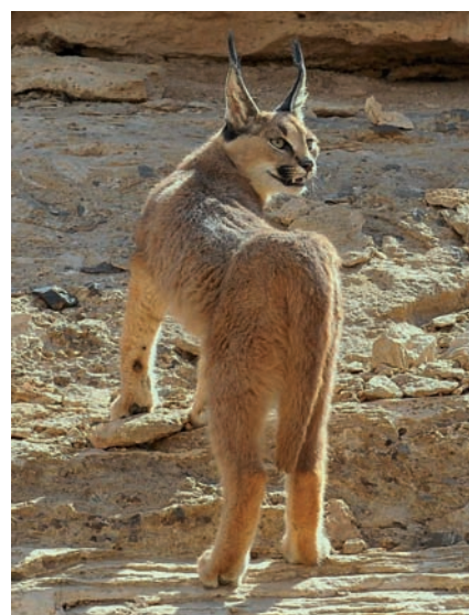
Fig. 1. A caracal in the vicinity of Nadushan, Yazd Province, in May 2009. Accused of killing domestic fowl, this caracal was chased by local villagers into a water canal to get drowned, but was eventually rescued by the local wildlife authority (Photo H. Moghimi).

The caracal was first classified by Schreber (1776) as a species of the genus Lynx , however, later assigned to the Felis group. More recent incorporation of morphological and molecular studies has proposed a new lineage, Caracal , with two genera, Caracal and Leptailurus . Hence, three species of Caracal , caracal C. caracal , African golden cat